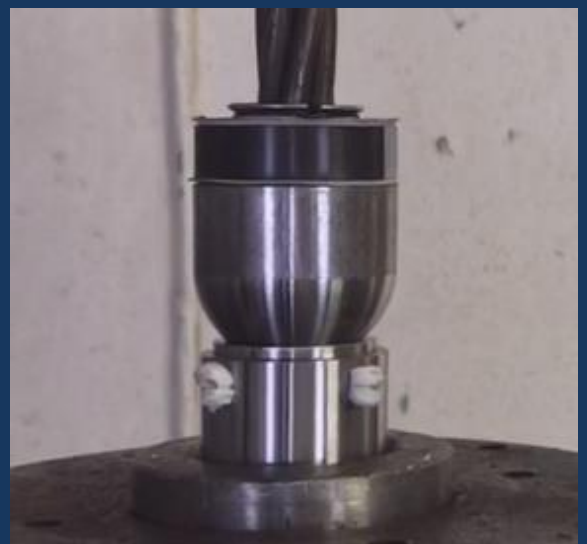
Activated V2 15T Event Indicator during press test. Note white plastic used during trials