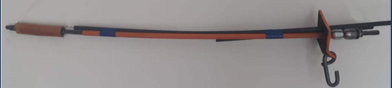
Complete 25t Cable Anchor with all components fitted including the V2 15T Event Indicator.