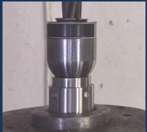
Non Activated V2 15T Event Indicator during press test. Note white plastic used during trials