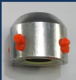
Activated V2 15T Event Indicator