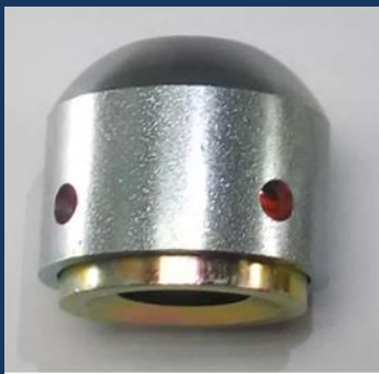
Non Activated V2 15T Event Indicator

The Event Indicator is unaffected during the tensioning of the 10t AMS Barrel. Only when \pm 3\text{mm} of stope convergence has occurred will the inner body enter the indicator nose and the plastic push out is forced through the four holes and be exposed.