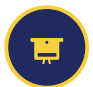
Training and Awareness