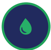
Water Resource Management